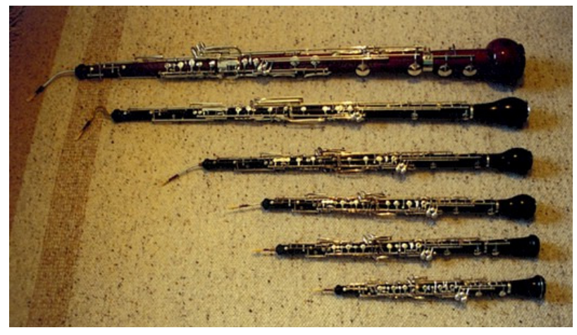
Members of the oboe family, ranging from the piccolo oboe (bottom) to heckelphone (top). The oboe and cor anglais, similar to those played in Ashby Concert Band, are second and fourth from bottom.

In comparison to other modern woodwind instruments, the oboe has a clear and penetrating voice. The timbre of the oboe is derived from the oboe's conical bore (as opposed to the generally cylindrical bore of flutes and clarinets). As a result, oboes are readily audible over other instruments in large ensembles. The reed has a significant effect on the sound of the instrument and subtle manipulation of embouchure and air pressure allows the player to express timbre and dynamics.